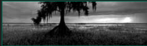
Bald Cypress • Taxodium distichum

** For large quantity orders, please call the Florida Urban Forestry Council at 407-872-1738 for special pricing **