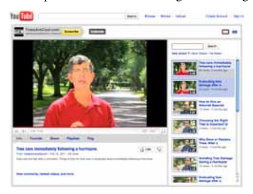
Treesarecool YouTube Channel: <u>www.youtube.com/user/treesarecooldotcom</u> Add Trees4Florida videos to your website!

June 1 marked the beginning of the 2011 Hurricane Season which runs through November 30. Trees4Florida has produced a media campaign focused on making the public more aware of the need to be vigilant in safeguarding our trees. We appreciate your efforts in helping us spread the message to safeguard our trees from the ravages of weather, time and nature. Please enjoy this page that provides access to directly listen to or download broadcast-quality TV PSAs in English and Spanish. If you are planning to air one of our public service announcements please contact us at 407.539.5981 so that we can keep track of how our message is reaching the public.