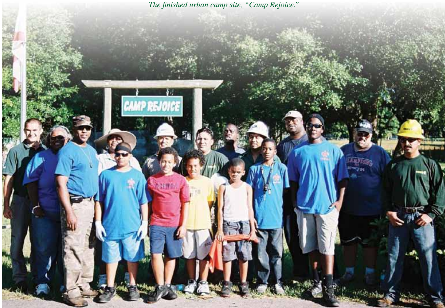
The finished urban camp site, "Camp Rejoice."