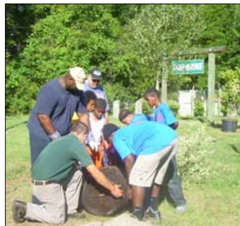
Volunteers from Davey Tree Expert Company, Boy Scouts and OUC working side by side.

Rejoice" hosts hundreds of Boy Scouts each year. Now, Camp Rejoice provides the Boy Scouts with a scenic site close to home to learn about camping and nature. It has become a place where they can gather and grow right along with the trees they planted.